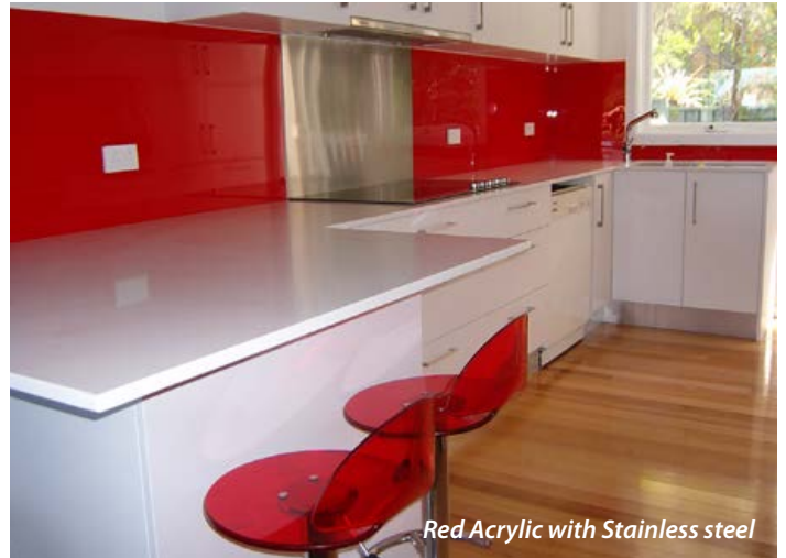
Red Acrylic with Stainless steel

Here are a few of the many benefits of acrylic splashbacks: