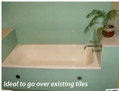
Ideal to go over existing tiles

Acrylic splashbacks look a lot like glass, which is part of their appeal as they tend to be more cost effective. They are often used to modernise a bathroom, laundry or shower. Installed in kitchens they look stunning with a heat proof insert behind the cook top. The acrylic is essentially a rigid plastic with an incredibly high transparency, so it won't develop a yellow tinge over time. Installed in long sheets or as a simple panel, an acrylic splashback is a relatively easy and inexpensive way to modernise your home and impress guests (and prospective buyers). The beauty of acrylic splashbacks is that they come in a rainbow of colours.