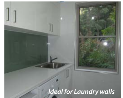
Ideal for Laundry walls

We will be closed over Christmas from 20th December and returning on 27th January 2014.