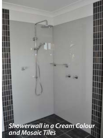
Showerwall in a Cream Colour and Mosaic Tiles

Acrylic splashbacks look a lot like glass, which is part of their appeal as they tend to be more cost effective. They are often used to modernise a bathroom, laundry or shower. Installed in kitchens they look stunning with a heat proof insert behind the cook top. The acrylic is essentially a rigid plastic with an incredibly high transparency, so it won't develop a yellow tinge over time. Installed in long sheets or as a simple panel, an acrylic splashback is a relatively easy and inexpensive way to modernise your home and impress guests (and prospective buyers). The beauty of acrylic splashbacks is that they come in a rainbow of colours.