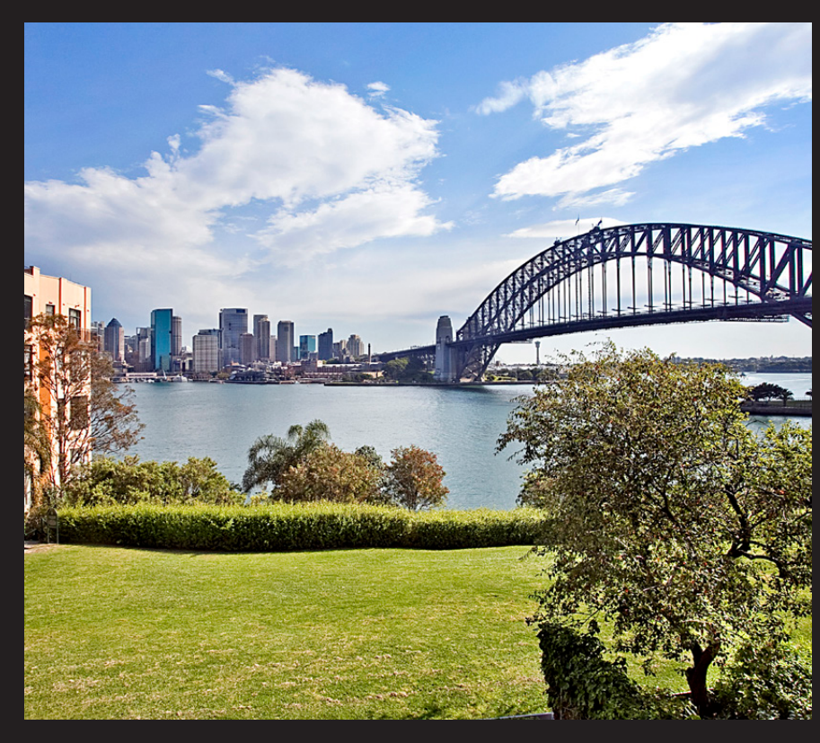
A suburbs mood, movement and culture can be reflected in a single frame and become an integral selling point for your property.