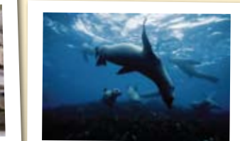
Amazing marine life