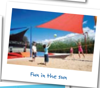
Fun in the sun