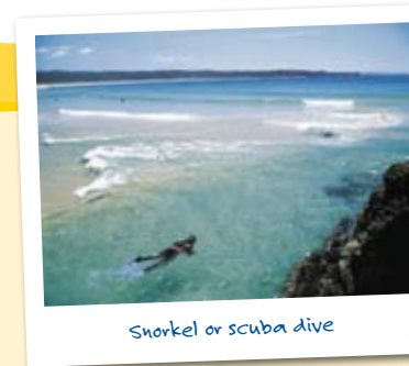
Snorkel or scuba dive