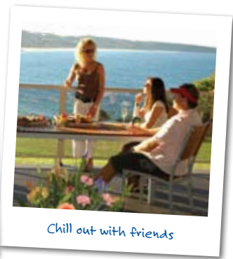
Chill out with friends