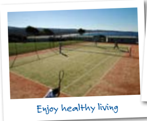
Enjoy healthy living