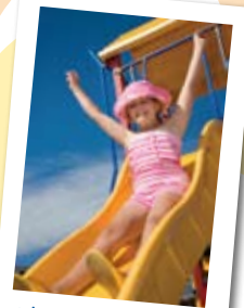
It's always playtime