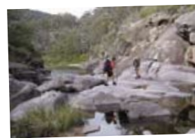
Bushwalking off the beaten track