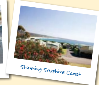
Stunning Sapphire Coast