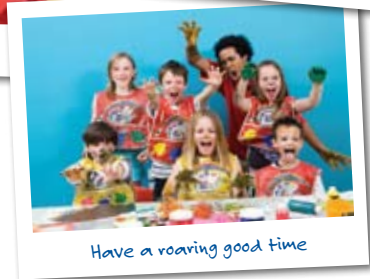
Have a roaring good time