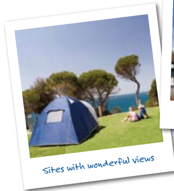
Sites with wonderful views