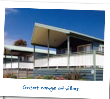
Great range of villas