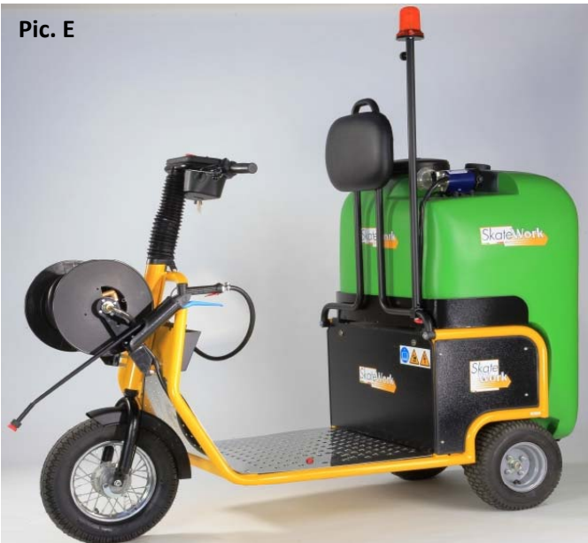
Tank and spray kit