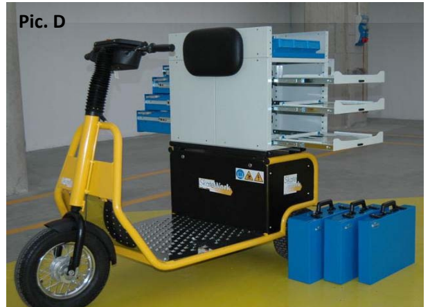
Drawer tool kit