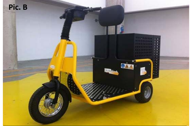
Compact storage cartridge