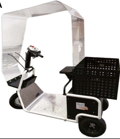
Plexiglass anti-uv weather proof canopy