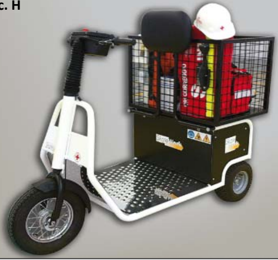
Emergency kit & Storage mesh box