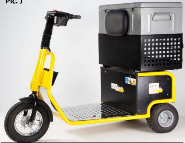
Storage box + Canister