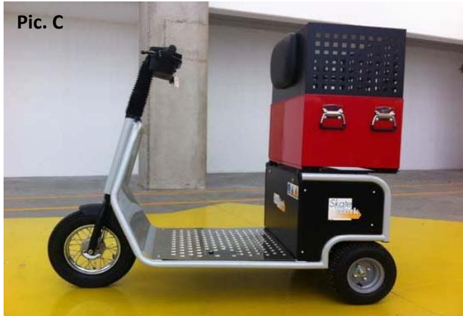
Toolbox and storage box