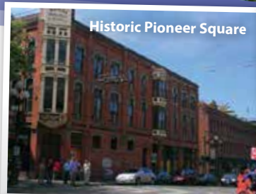
Historic Pioneer Square

We reserve the right to adjust the itinerary as it sees fit to ensure the smooth running of the tour and to substitute hotels of a similar standard if the hotels listed in our brochure are not available. Passengers must remain with the tour group at all times and must not deviate from the set itinerary unless otherwise stated such as "free at leisure".