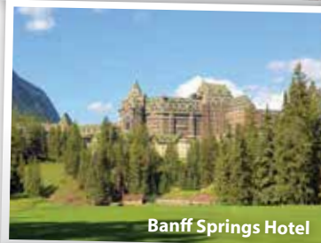
Banff Springs Hotel