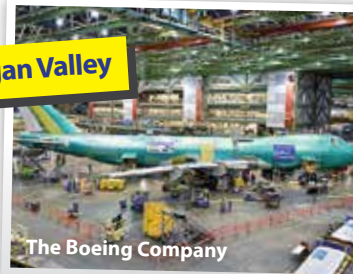
The Boeing Company

Pick up from Seattle Pier and drive north to Seattle Premium Outlet where you can find the world's finest outlet shopping with over 120 stores at incredible prices. In the afternoon cross the border into Canada and stay overnight in Harrison Hot Spings.