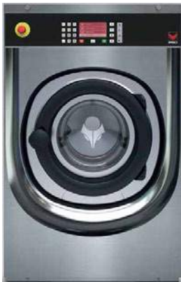
Pictured above: IY65-280