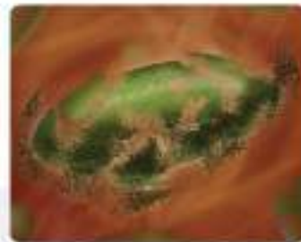
Bacteria cell disintegrates