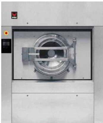
Pictured above: IY335-1200