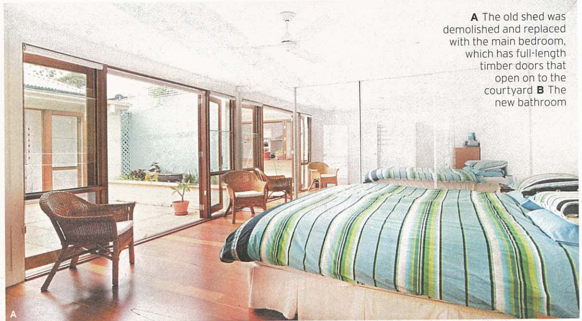
A The old shed was demolished and replaced with the main bedroom, which has full-length timber doors that open on to the courtyard B The new bathroom

● MORE INFORMATION Sydney Flooring 9755 1899 sydneyflooring.com