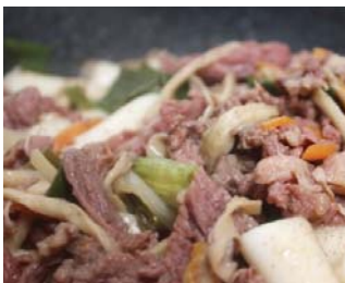
9.철판 소불고기 $14 BEEF BULGOGI WITH MIXED VEG