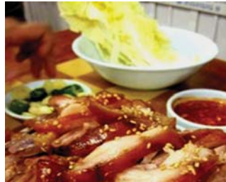
29.족발 한접시 $13 猪肘子 PORK TROTTER WITH SPECIAL SAUCE