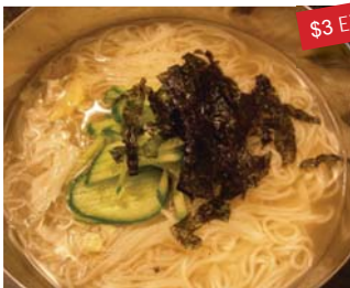
21.멸치국수 $10 VERMICELLI WITH ANCHOVY BROTH