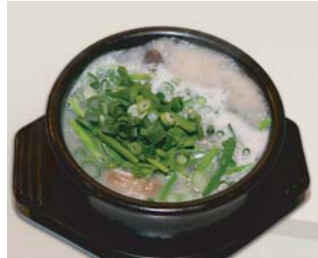
5. 순대국밥 $12 圣代(韩国肉肠)汤米粉 SOONDAE & VEG SOUP WITH RICE