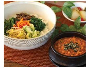
17.강된장 비빔밥 $11 BIBIMBAB RICE & VEG WITH SPECIAL SOY BEAN SAUCE