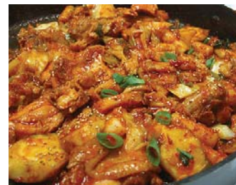
11.철판 닭불고기 $14 CHICKEN BULGOGI WITH MIXED VEG