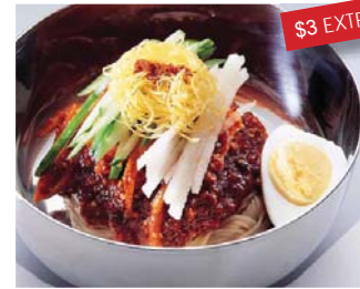
20.비빔냉면 $10 拌菜冷面 MIXED VEG WITH COLD NOODLES