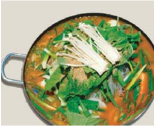
10. 감자탕 (M)$25/(L)$30 香料马铃薯辣骨锅 SPICY POTATO & PORK BONE STEW