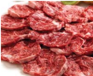
6.제비추리(200g) $14 小块薄群牛肉 ROPE NECK CHAIN BEEF