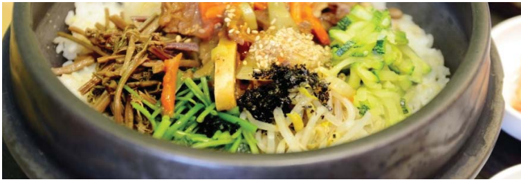
16.소갈비 돌솥비빔밥 or 돼지갈비 돌솥비빔밥 $13 烤牛(猪)排 拌菜米饭 MARINATED BEEF RIB or PORK RIB & MIXED VEG WITH RICE