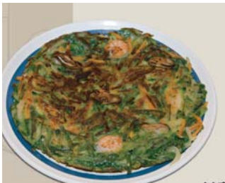
31.해물 부추전 $13 香葱煎饼 GARLIC CHIVES & SEAFOOD PANCAKE