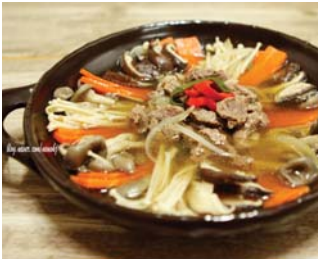
13. 소고기 버섯 전골 (M)$30(L)$35 BEEF & MUSHROOM STEW