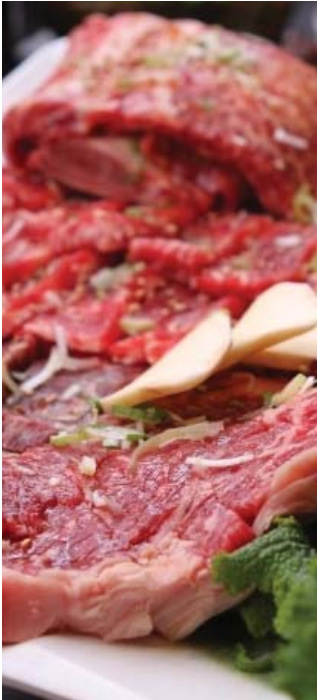
1.모듬 구이 $55 와규/양념 소갈비/삼겹살/제비추리 COMBINATIONS OF wagyu/ beef ribs/pork belly/ rope neck chain beef (FOR 3-4 PEOPLE)