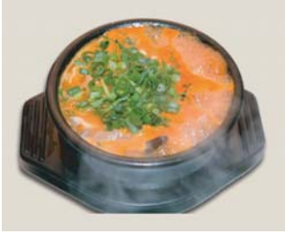
1. 돼지국밥 $12 猪肉菜汤 米饭 PORK SOUP WITH RICE