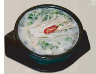
6. 해물 두부 국밥 $12 海鲜豆腐汤 米饭 SEAFOOD & TOFU SOUP WITH RICE