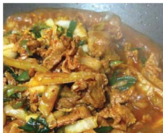
10.철판 돼지불고기 $14 PORK BULGOGI WITH MIXED VEG