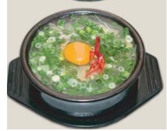
3. 콩나물 해장국 $10 豆芽汤米饭 BEAN SPROUT SOUP WITH RICE