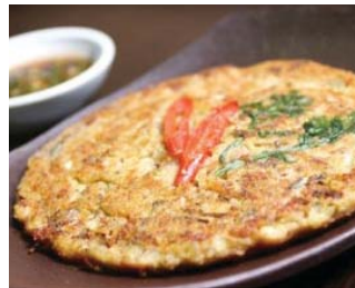
32.빈대떡 $11 MUNG BEAN PANCAKE