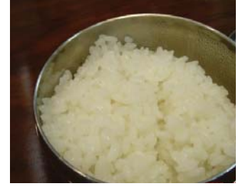
14. 공기밥 $1 BOWL OF RICE