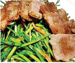
36. 돼지고기와 부추 $13

PORK & GARLIC CHIVES WITH SAUCE SMALL DISH