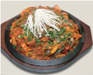
28.순대 볶음 $30 烤圣代 (韩国肉肠) STIR FRIED SOONDAE WITH VEGETABLES SMALL DISH $13