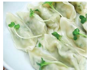
44. 물만두 $6