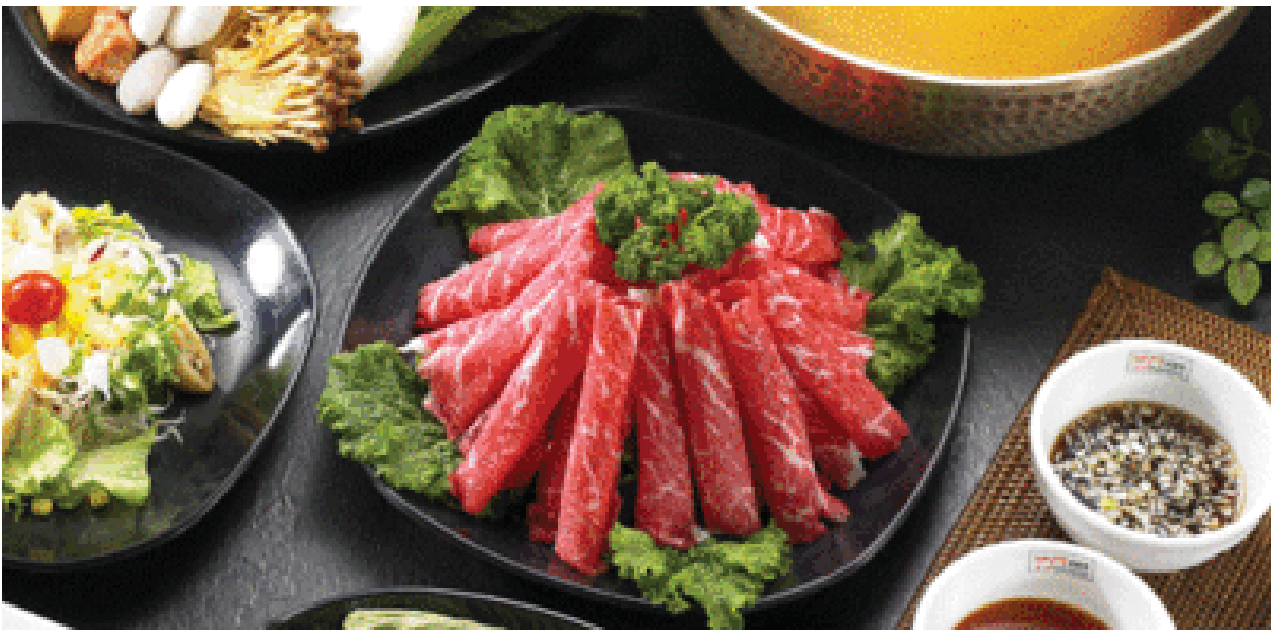
15. 샤브샤브 소고기 $35 火鍋 SLICED BEEF & MIXED VEG WITH VARIETY OF SAUCES