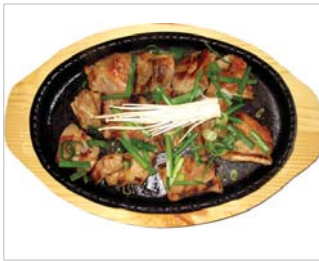
40. 돼지갈비 $13