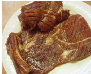
7.양념 돼지갈비 $14 腌猪排 MARINATED PORK RIBS