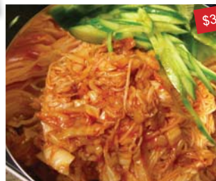
23.비빔국수 $10 VERMICELLI WITH SPICY SAUCE