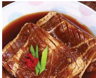
4.양념 소갈비 $16 腌牛腩排 MARINATED BEEF RIBS