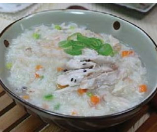
42. 마늘닭죽 $10