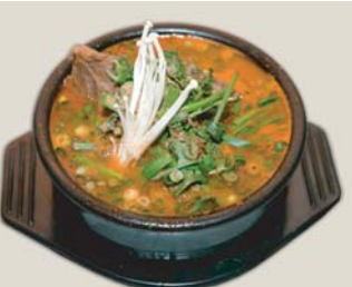
4. 뼈다귀 해장국 $12 猪肉骨汤 米饭 PORK BONE SOUP WITH RICE