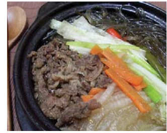
38. 불고기 $13

소고기 / 돼지고기 / 닭고기 BULGOGI BEEF / PORK / CHICKEN