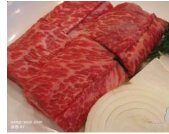
3.생갈비 $16 牛腩排 BEEF RIBS