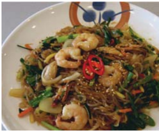
18.해물잡채 $13 海鲜拌菜面 MIXED SEAFOOD & VEG WITH SWEET POTATO NOODLES