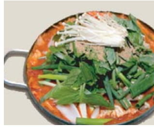
11. 곱창전골(M)$30(L)$35 大肠辣肠锅 SPICY BEEF INTESTINES & MIXED VEG STEW