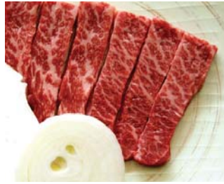
2.와규부채살 $25 (200g) 烤牛排 WAGYU OYSTER BLADE