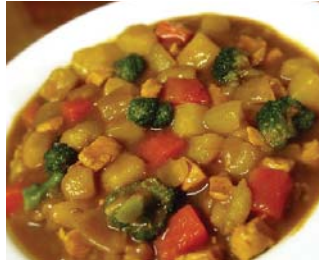
37. 치킨카레 $12

PORK & GARLIC CHIVES WITH SAUCE SMALL DISH