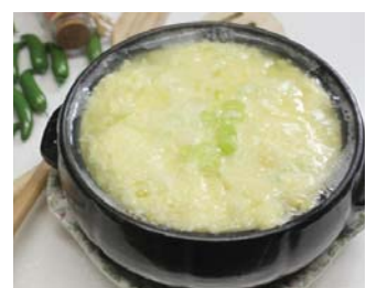
41. 계란찜 $10