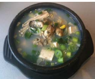
7. 굴 국밥 $13 生蚝汤 米饭 OYSTER SOUP WITH RICE