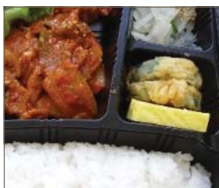
45. 불고기 도시락 $12 (소불고기/돼지불고기/닭불고기)