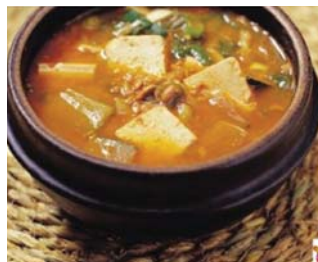
8. 된장찌개 $12 黄豆酱辣锅 SOY BEAN PASTE HOT POT