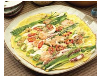
33.해물 파전 $13 SPRING ONION & SEAFOOD PANCAKE