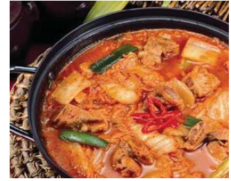
12. 김치찌개 (M)$25/(L)$30 韩国泡白菜锅 SPICY KIMCHI WITH PORK STEW