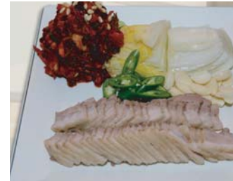
30.보쌈 $35 杂锦菜蒸肉 STEAMED PORK WITH LETTUCE & CHINESE CABBAGE WRAP