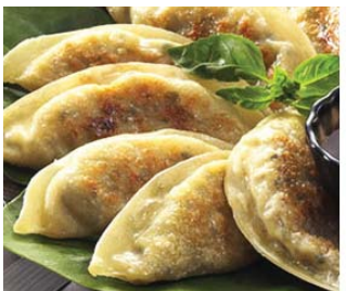
43. 군만두 $6