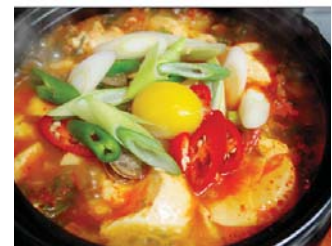
9. 순두부찌개 $12 SOFT TOFU HOT POT