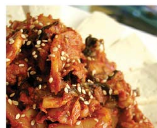
35.돼지 두부 김치 $30 STIR FRIED KIM-CHI & PORK WITH TOFU