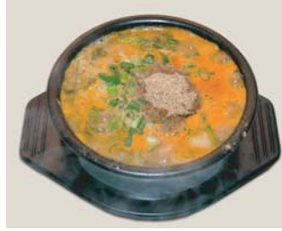
2. 우거지 해장국 $10 白菜汤米饭 CHINESE CABBAGE SOUP WITH RICE