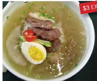
19.물냉면 $10 冷汤面 COLD NOODLES SOUP