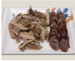
26.순대모듬 안주 $20 蒸圣代 (韩国肉肠) SOONDAE COMBINATION DISH