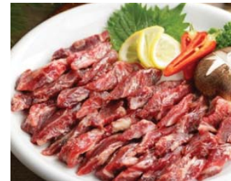
5.갈비살(200g) $15 小块牛肋排 BONELESS BEEF RIBS