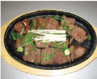
39. 소갈비 $15

소고기 / 돼지고기 / 닭고기 BULGOGI BEEF / PORK / CHICKEN