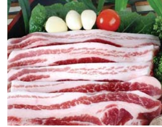
8.생삼겹살(250g) $13 薄切猪腩 THIN SLICED PORK BELLY