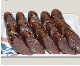
25.순대 한접시 $10 圣代 (韩国肉肠) SOONDAE SMALL DISH