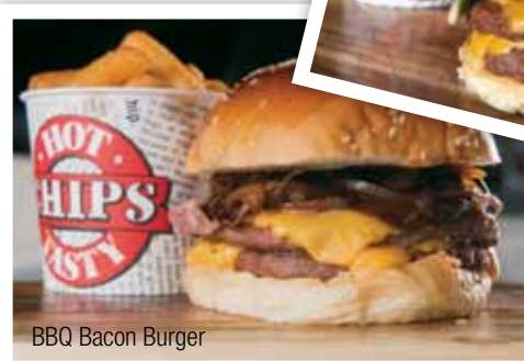
BBQ Bacon Burger

Double meat pattie, double cheese, lettuce, spanish onion with primo special sauce served with chips.