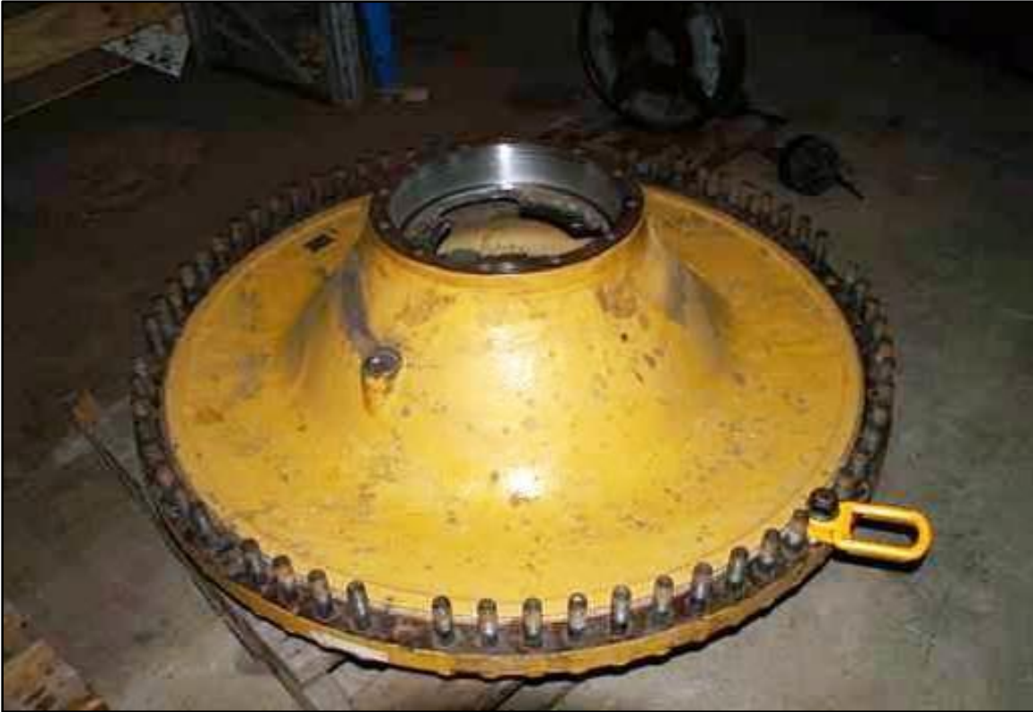
789 Front Wheel Hub – bearing reclamation