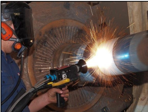
9 Tonne Crusher Shaft