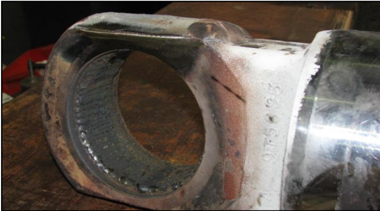
Cylinder eye reclaim