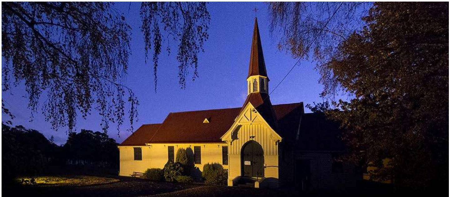
St Mark's Anglican Church, George St Cygnet

Cygnet Mitre 10 - 15 Mary St Cygnet. ☎ 03 6295 1962. The local timber & hardware store. 8.30am – 5pm Mon – Fri, Sat 9am – 4pm, Sun 10am – 3pm. www.mitre10.com.au