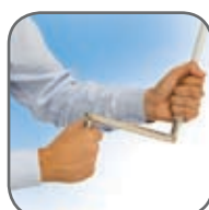
Crank Handle With 240V Electric Manual Override Motor

* CW Products recommends that FireSafe Bushfire Rated Roller Shutters shall: a) be fixed to the building and be non-removable; b) when in the closed position, have no gap greater than 3mm between the shutter and the wall, the sill or the head; c) be readily manually operable from either inside or outside; d) protect the entire window assembly or door assembly; e) consist of materials specified in Clauses 5.5.1, 6.5.1, 7.5.1, 8.5.1 and 9.5.1 for the relevant BAL.