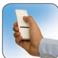
Remote Control With 240V Electric SIMU Hz Manual Override Motor