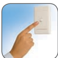
Wall Switch With 240V Electric Manual Override Motor