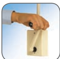
Steel Cable Winder (Up To 50Kg)