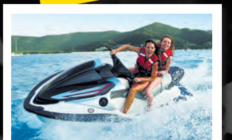
Fun filled Jetskiing