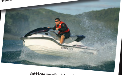
action packed jetskiing