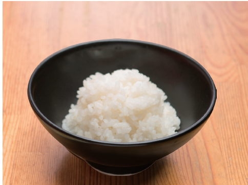
明太ご飯 明太子飯 Mentai Gohan $5 Spicy cod roe on rice