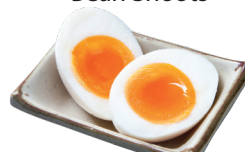
味玉 Soy-marinated $5 Egg