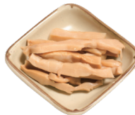
メンマ Bamboo Shoots $2