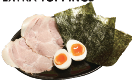
スペシャルトッピング Special Toppings $8.00 チャーシュー3枚、味玉、のり3枚 Cha-Shu x3, Flavoured Egg, Seaweed x3