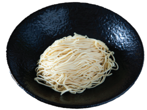
替玉 EXTRA $2 NOODLES (served separately)