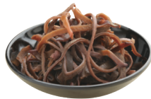
きくらげ Black Fungus $2