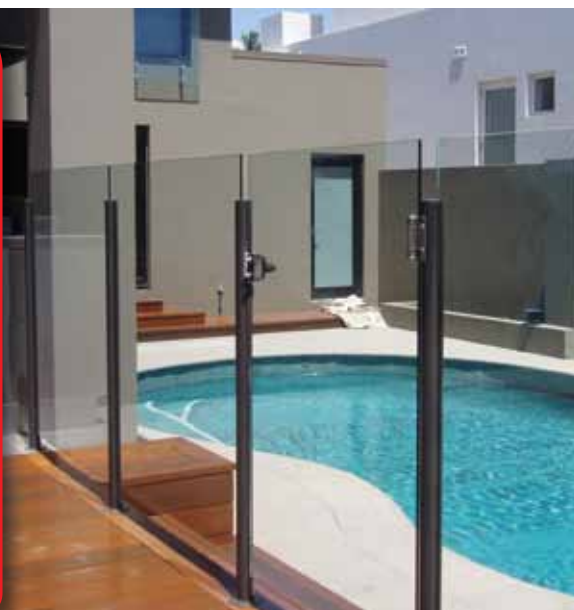
PROJECTED SEMI FRAMELESS