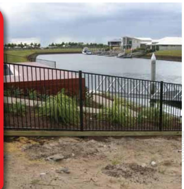
FLAT TOP FENCE