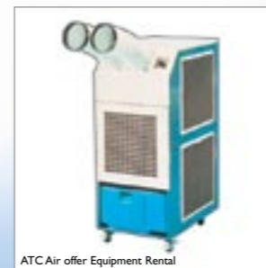
ATCAir offer Equipment Rental

As part of our Service and maintenance division ATC carry out a wide range of construction projects. In all of our projects we ensure that a balance is maintained between timely completion, initial costs and quality of completion. At ATC we pride ourselves on working with our customers to produce the best outcome, whether the focus is productivity, energy consumption, down time or air quality.