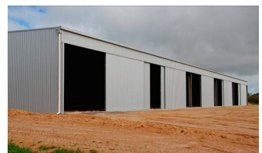
20 x 6.5H x 8W Sliding Doors