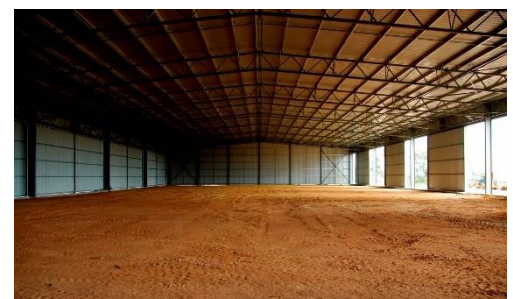
Parallel Cord Web Trusses