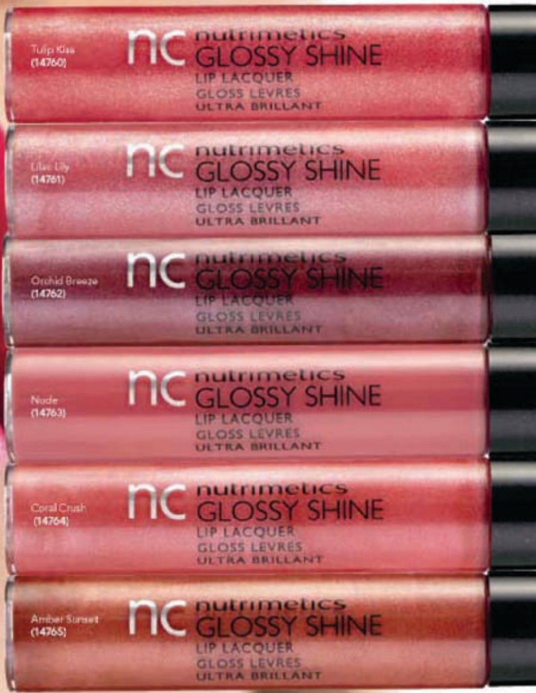
Model wears NC Perfecting Lip Pencil 'Cranberry' (14391) and NC Glossy Shine Lip Lacquer 'Tulip Kiss' (14760)