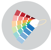
DIGITAL AND OFFSET PRINT

RMA offer a range of integrated solutions based on your budget and your timeframes.