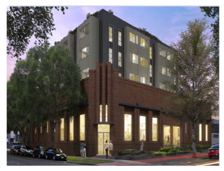
755 Botany Road, Rosebery 31 Apartments and 2 Retail Construction Cost: $9.0mil Construction Duration: 14 months Commencement date: April 2014 Project Manager: Cemento Construction Pty Ltd Architect: Environa Studio Delivery: Fixed Lump Sum

Please see current working progress jobs and completed projects