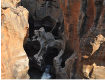
Bourke's Luck Potholes