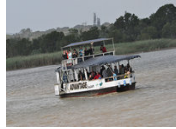
St Lucia Wetlands