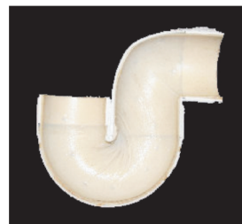
Sample of our Patented "True Fit" Liner Installed in a Tight PVC "P" Trap