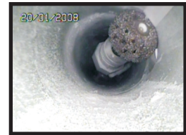
DRAIN SOLUTIONS ROBOTIC LATERAL CUTTER

DRAIN SOLUTIONS imports and uses high quality Liner, Resin, Pipe Lining materials and equipment from the USA and Europe to re-line deteriorated or damaged pipes. We were trained to use this technology in the USA and Europe.