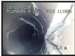
DAMAGED PIPE BEFORE PIPELINING

DRAIN SOLUTIONS uses a cost effective Pipelining "NO DIG" Trenchless Rehabilitation Technology solution to replace damaged or cracked pipelines and root intrusion to sewer or stormwater pipelines without disruptive excavation or damage to property.