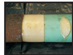
Cast & PVC Pipe with Hole & Liner Bridging Broken Sections

Pipe systems are often inaccessible - in walls or under floors, gardens, concrete or paving. By re-lining pipes, excavation and damage to property is unnecessary and can be completed with minimal interference to the customer.