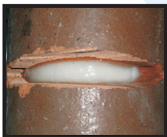
Liner Seals Broken Area in Clay Pipe Creating a 100% Seal & Making Pipe Water Tight

DRAIN SOLUTIONS imports and uses high quality Liner, Resin, Pipe Lining materials and equipment from the USA and Europe to re-line deteriorated or damaged pipes. We were trained to use this technology in the USA and Europe.