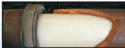
Liner Bridging Broken Section of Clay Pipe Creating a 100% Seal & Making Pipe Water Tight