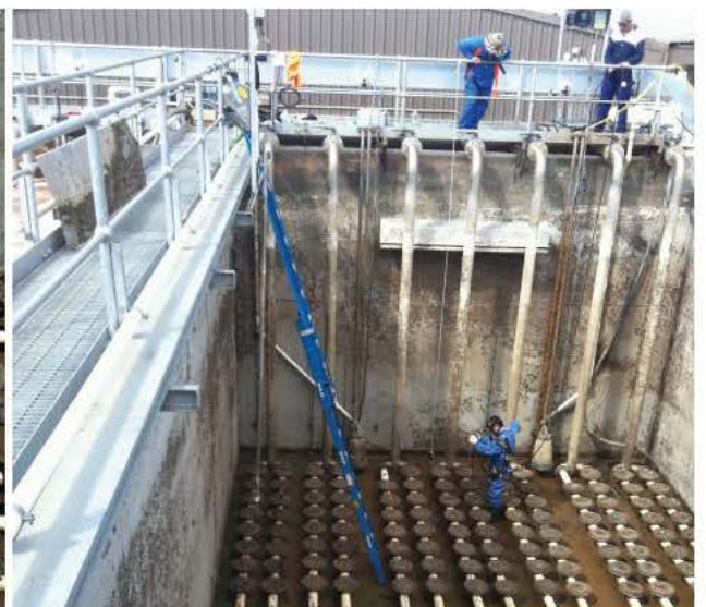
Bio-Reactor repairs and maintenance at Snack Brands Australia - Smithfield