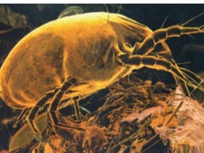
You never sleep alone!

for numerous allergic reactions. Asthma is increasing at an alarming rate amongst children and is one of the ailments that are triggered by the chemical Guanine.