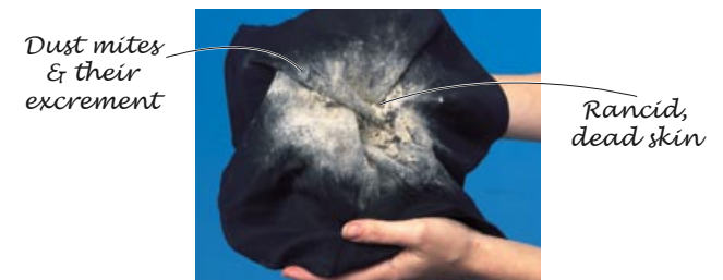
Infestation is in every mattress