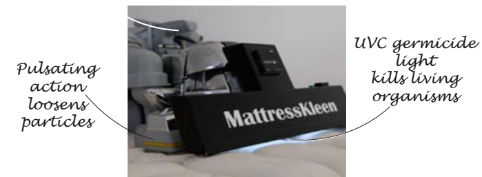
We sanitise and deodorise