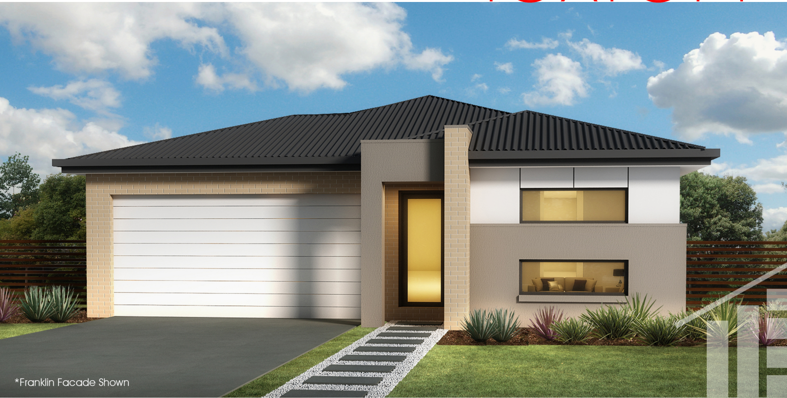
*Franklin Facade Shown