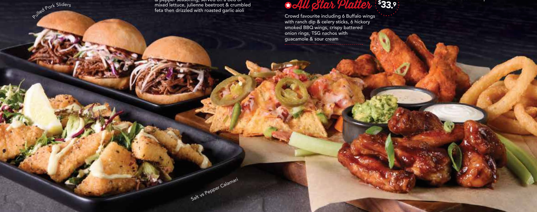
Pulled Pork Sliders

Topped with streaky bacon, tasty & mozzarella cheese & spring onions, with sour cream & sweet chilli dip