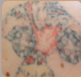
At 12 wks after 1st treatment