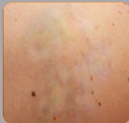
At 12 months after 5 treatments