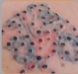
Immediately after 1st treatment