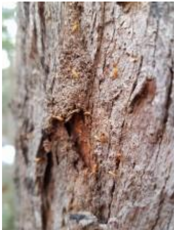
Live Activity Noted To Tree