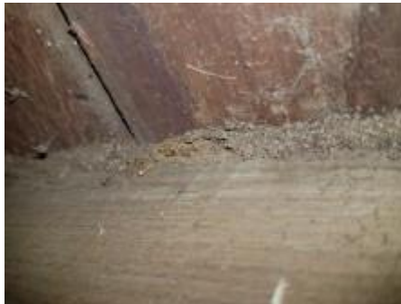
Live Termite to Bearer and Mudding to Joist