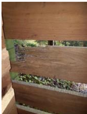
Decay and old damage to sub floor fence