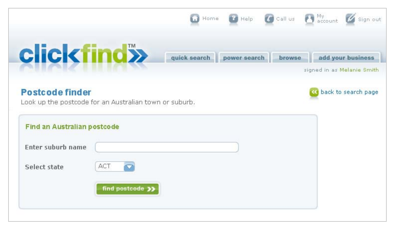
Step 1 – enter suburb and state

If you don't know the postcode (for example if you're looking for a business when you're going away from home) you can find it easily by entering the relevant suburb and state.