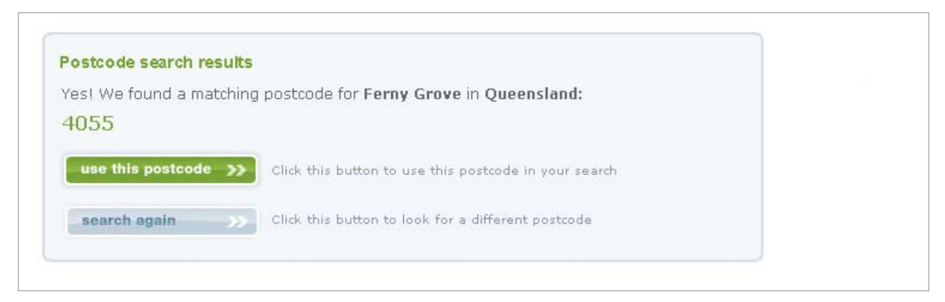
Step 2 – use the matching postcode in your search